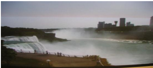
Niagara Falls, Canada

The 35 th annual bus trip around the USA will leave July 1, 2011 and return July 31, 2011. This trip is made available to Rotary Exchange Students who have the means and desire to see the USA.