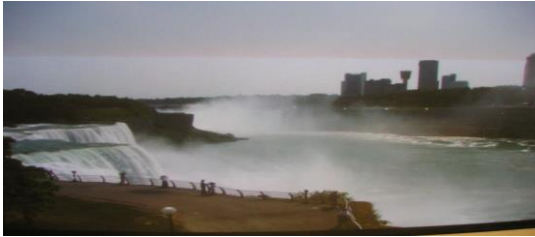
Niagara Falls, Canada

The 42 ND annual bus trip around the USA will leave July 1, 2018 and return July 31, 2018. This trip is made available to Rotary Exchange Students who have the means and desire to see the USA.