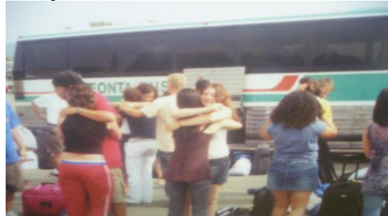
There are 9 adult chaperones.

COST OF FOOD: $800 is a recommended amount, some students have spent less and some have spent MUCH more. This money is to be handled and budgeted by the student. Cost of Souvenirs, camera supplies and other extras are the direct responsibility of each student and must be in addition to the food money. The funds should be Travelers checks or Debit/Credit Cards. Since the trip is 31 days the $800 will mean a little less that $26 per day.