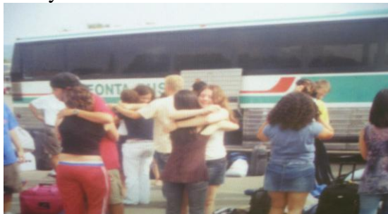
There are 9 adult chaperones.

COST: $ 2,200 Per person for transportation, lodging, and sightseeing. Travel will be via deluxe air-conditioned motor coach. Lodging will be in hotels and motels. COST OF FOOD: $800 is a recommended amount, some students have spent less and some have spent MUCH more. This money is to be handled and budgeted by the student. Cost of Souvenirs, camera supplies and other extras are the direct responsibility of each student and must be in addition to the food money. The funds should be Travelers checks or Debit/Credit Cards. Since the trip is 31 days the $800 will mean a little less that $26 per day.